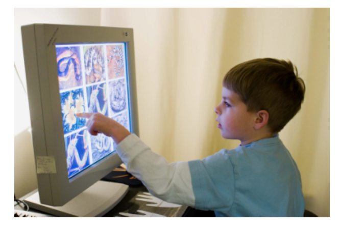
Fig. 1. A preschool child identifying the single flower target among eight snake distractors by touching the flower image on a touch-screen monitor.

The participants in the experiments were one hundred twenty 3to 5-year-old children and their 120 accompanying parents.